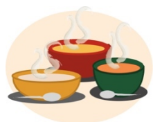
Table of Plenty is a free community meal held here at the Newman Center on Wednesday night at 6:00. All are welcome to join for dinner!

Daily Mass is offered at St. Columba Cathedral Monday through Friday at 12:10. St. Patrick's in Youngstown also offers daily Mass Monday through Friday at 8:30am except on Wednesday morning; a Word and Communion Service. St. Edward's Parish also in Youngstown offer daily Mass Monday through Saturday at 8:30 am.