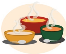
Table of Plenty is a free community meal held here at the Newman Center on Wednesday night at 6:00. All are welcome to join for dinner!

Daily Mass is offered at St. Columba Cathedral Monday through Friday at 12:10. St. Patrick's in Youngstown also offers daily Mass Monday through Friday at 8:30am except on Wednesday morning; a Word and Communion Service. St. Edward's Parish also in Youngstown offer daily Mass Monday through Saturday at 8:30 am.