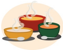
Table of Plenty is a free community meal held here at the Newman Center on Wednesday night at 6:00. All are welcome to join for dinner!

Daily Mass is offered at St. Columba Cathedral Monday through Friday at 12:10. St. Patrick's in Youngstown also offers daily Mass Monday through Friday at 8:30am except on Wednesday morning; a Word and Communion Service. St. Edward's Parish also in Youngstown offer daily Mass Monday through Saturday at 8:30 am.